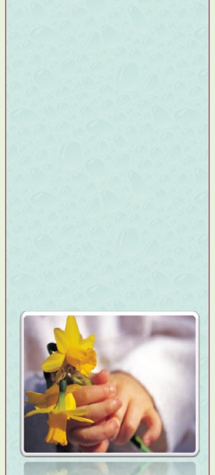
Power of beauty Beauty acquires its power only when it is surrendered to the Divine.